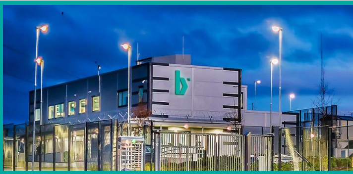
Entrance and building at N01 Campus.

The ultimate solution went far beyond the more routine offerings of colocation, dedicated white space, build-to-suit, or powered land. Bulk tapped their network of established partners to reduce complexity and to help plan and execute this project to meet an aggressive timeline. They helped the customer with power procurement analysis and counsel on attractive options using ADAPT. They also provided advice on import tax rules, where Bulk obtained a binding ruling to further simplify the process and help to limit cost. Bulk were able to support the logistics in receiving and managing the equipment and by acting as an importer of record, reducing the cost significantly.