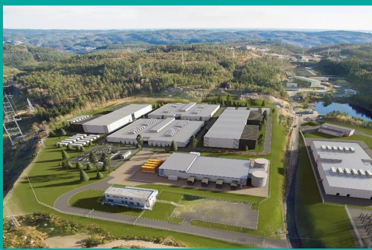
3D illustration of our N01 Campus in Kristiansand.

Now with the data center live in Bulk’s N01 campus the company is benefitting from a highly resilient solution which is 100 percent carbon free. And with cost savings of up to 60 percent on power alone when compared to an equivalent installation in London it really hits home the potential TCO benefits of being with Bulk in Norway.