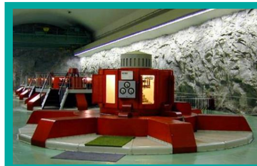
Hydro power station in Kristiansand.

They came into the market looking for more data center space to house their high performance computing (HPC) research cluster but with a keen desire to focus on sustainability and also drive a lower total cost than traditional colocation.